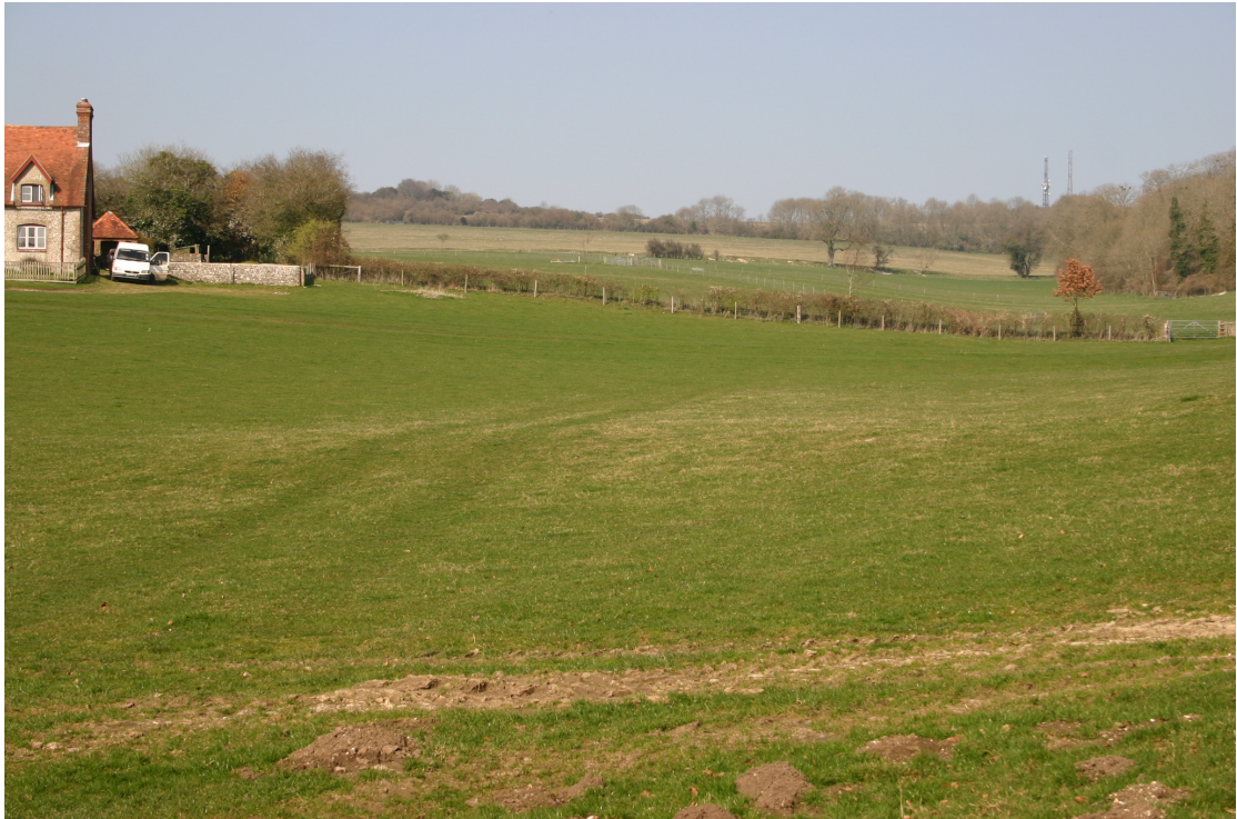
Fig.2 Field at the Gumber, with area of parched grass.