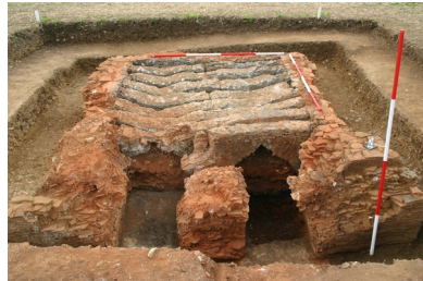
Photograph of the Binsted Tile Kiln, WAS excavation 2005

In 2001 Worthing Archaeological Society undertook an excavation in 'Green Field' Church Farm Binsted. A structure was identified. Excavations in 2005 revealed the lower portion of a tile kiln. Surface pottery, and a pot found within the kiln, was of Binsted manufacturer indicating dates of operation from AD1250 – 1550. (Gerald Hennings)