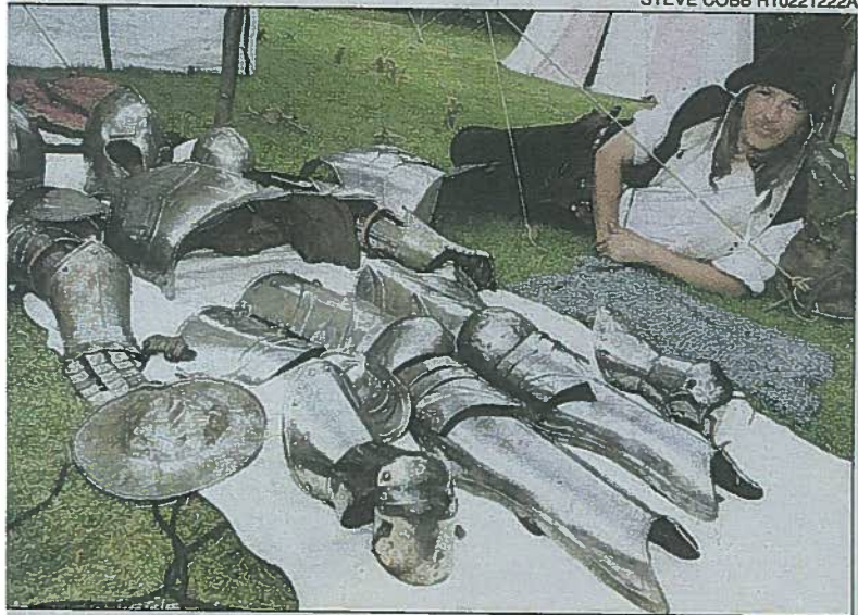
Whiteman with a suit of 15th century armour.