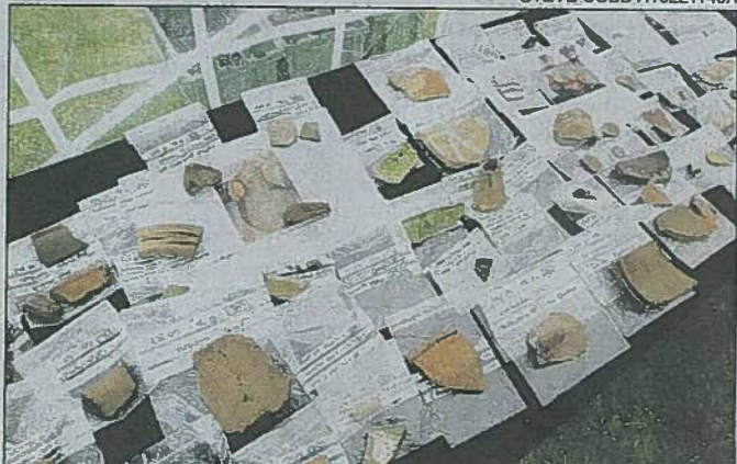
STEVE COBB H10221140A