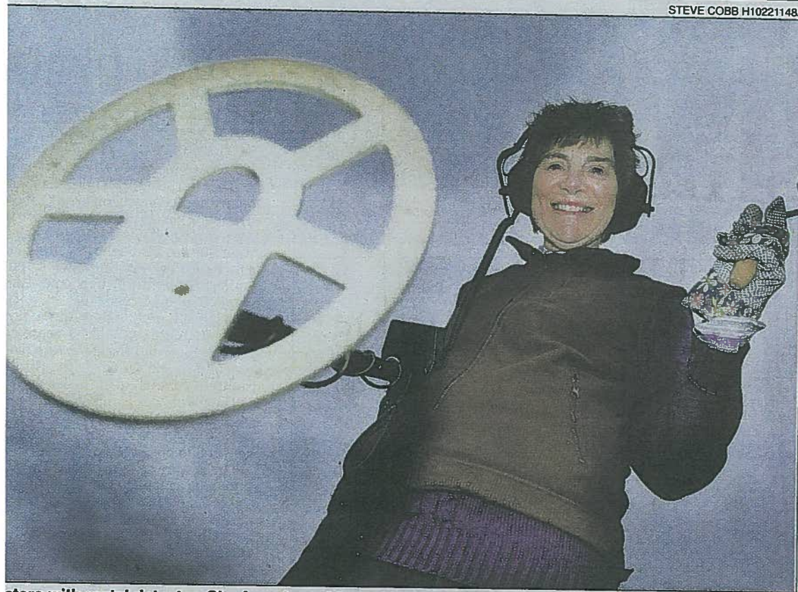
eters with metal detector. She found a gold monkey - possibly a belt adornment - at the site.