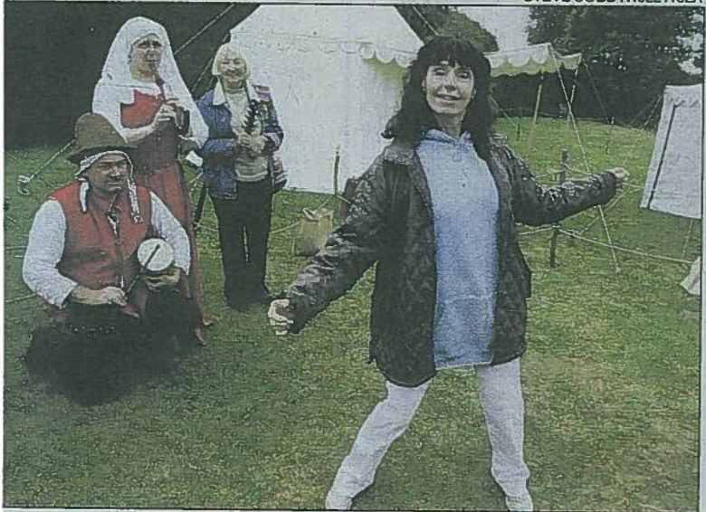
...Dane (front) can't resist a dig...