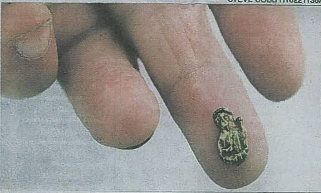
Above: This gold monkey was found at site.