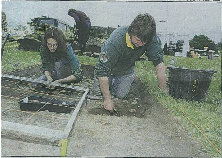
ers of Worthing Archeology Society hard at work.