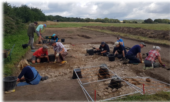
Hard at work