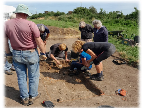
Retrieving the pot