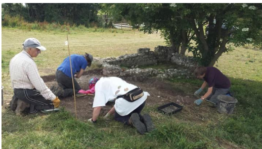
The flint walls that started it all

Connie gave us a history of the site, from the church - built in the 10 th century - to the current Tristram family landowners owning the land since 1879. A 1627 survey documented a Malting House on the site, 1772 Map shows the area as Malthouse Barn Field, Malthouse Field and Malthouse Close, a 1896 map shows a pond and line of trees and the 1936 South of England show map shows the excavation area as close to the entrance.