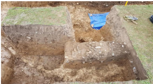
The enigma that was Trench 10

The 2019 excavations had only just finished so results are still being analysed, but trench targets had been established through Geophysical surveys in the spring. One survey had identified features in other paddocks. One was natural geology but the other (Trench 10) contained a modern water pipe (probably associated with the 1936 show), a degraded chalk surface which is found across the site which had features dug into it, a potentially military-cut trench, Romano-British pottery and a medieval pit containing Saxo-Norman pot sherds.