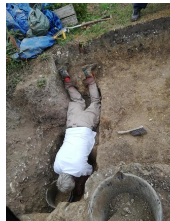
The well cut: the depths members had to sink to

A compact 'yard-like' surface was located below the north-south flint wall, and features that could be postholes were identified running along the middle of the building complex. The features are comparable with other known excavated Malthouse sites. A pit was also discovered that contained medieval pottery, oyster shell and worked flint, possibly evidence of an earlier occupation.