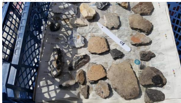
Some of the pottery found.

Several WAS Members went just before Easter to join Judie and HDAG folk to investigate an area to the east of Steyning Museum. There were many Finds, of many periods, but no evidence of structures.