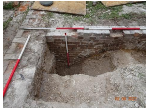
Figure 3 - Eastern Arch with North-South wall to the left Keith

The North-South wall is of a totally different construction and consists of chalk, flint, foreign stone and occasional brick with mortar. Wall steps out slightly a third of the way down. The East-West wall butts up to the North South wall (see figure 3 below), suggesting that the latter wall was constructed first.