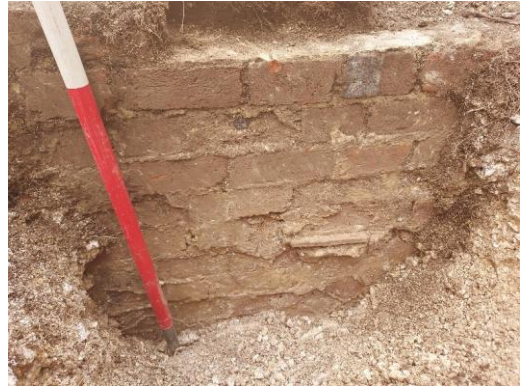
Figure 1 - Wall foundation with arch appearing bottom right

So the rest of the afternoon was spent on excavating a sondage, which revealed 10 courses of brick and what appeared to be the left-hand side of an arch. Figure 1 shows the arch on the bottom right, (excavation was still on-going when this photo was taken).