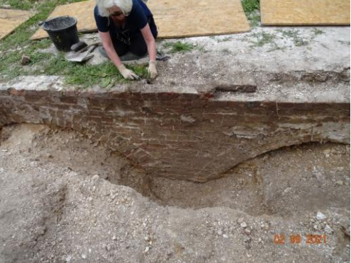
Figure 2 - Wall Elevation showing both arches

After a summer break (for the Malthouse excavation), in early September an excavation was undertaken to identify the range of the foundations. This revealed a second arch and brickwork which was between 0.9m and 1.2m deep (see figure 2 below).